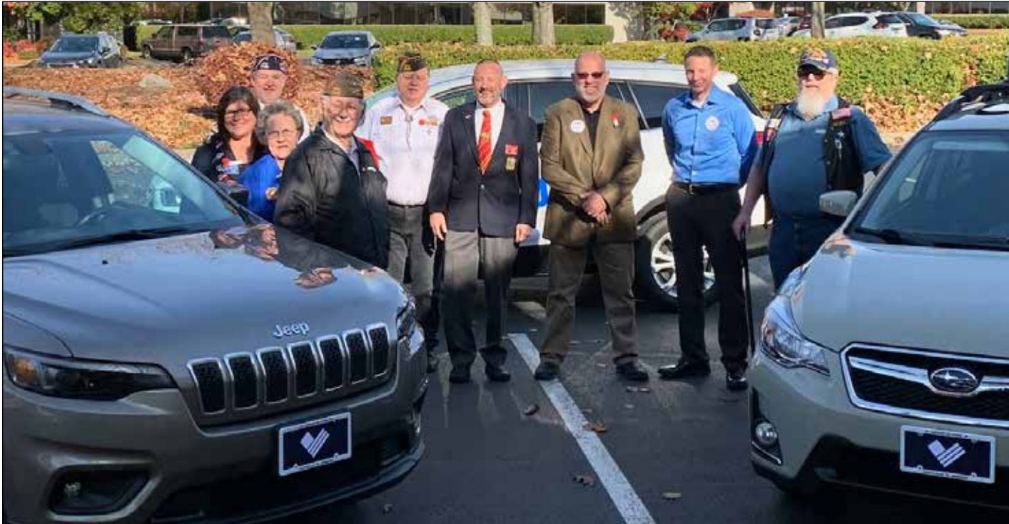
Progressive car recipients.