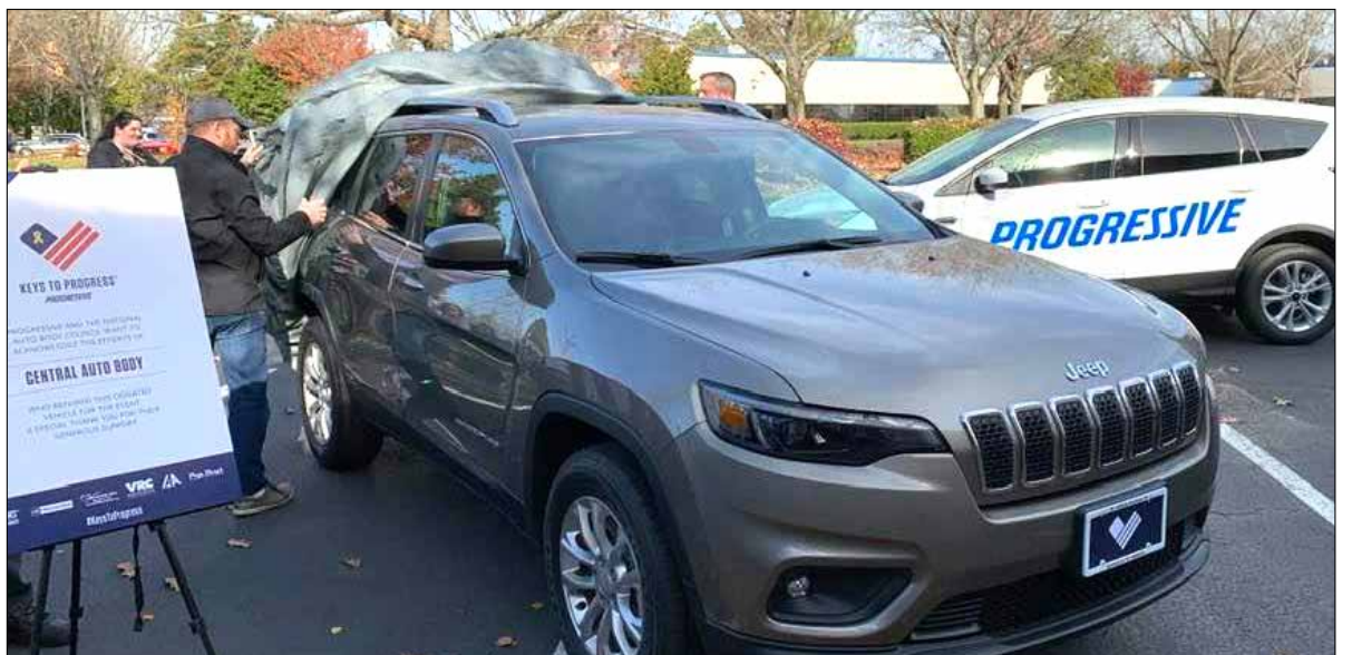
more photos on page 19