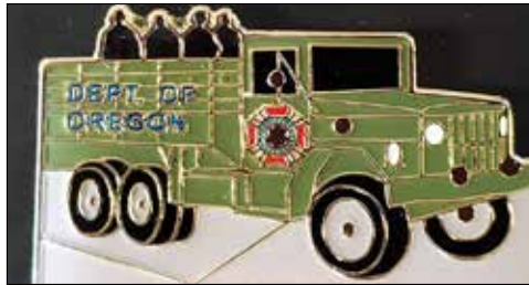
Full story on page 18.