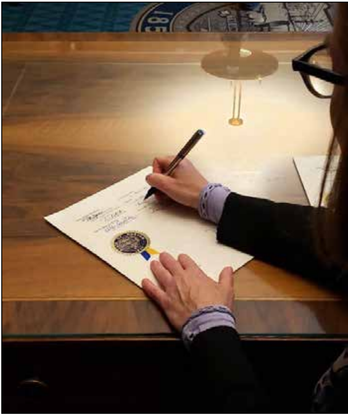
Governor Kate Brown signing HB 3452