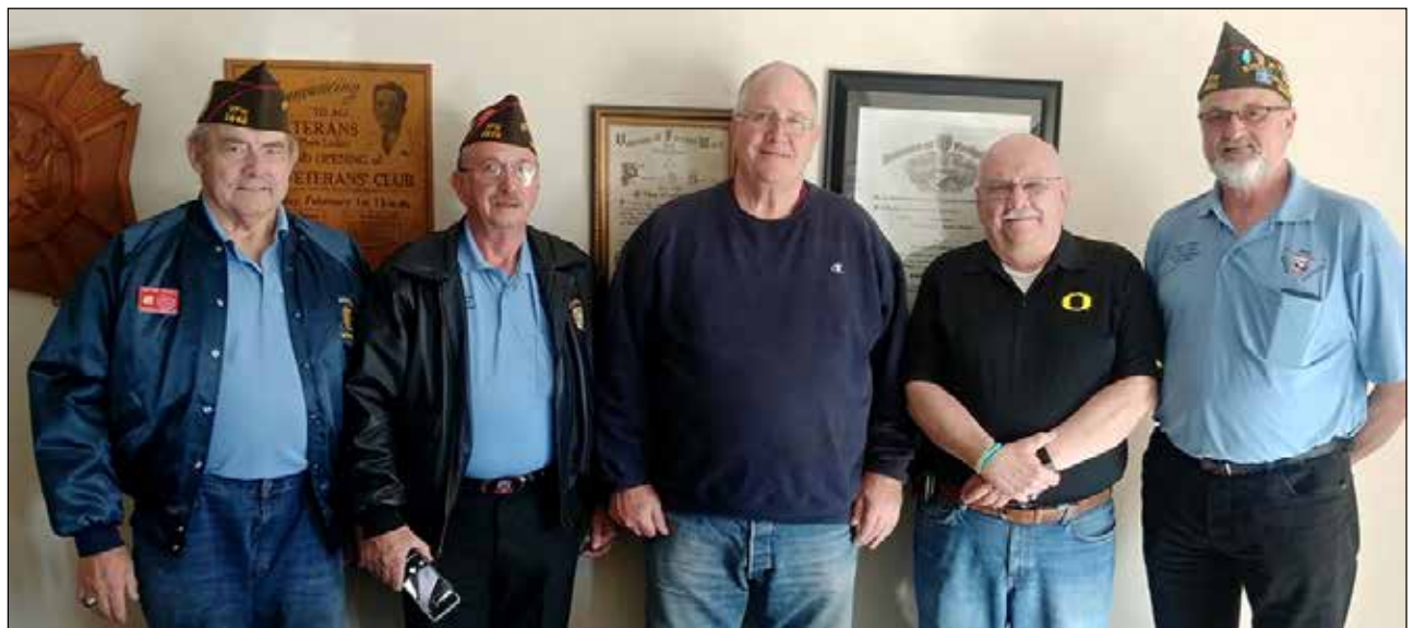
Get on Board Post 1833

We are only a phone call, text, or email away from you. We want to know your positive ideas on how to make us stronger and preserve our Veterans of Foreign Wars organization for generations to come.