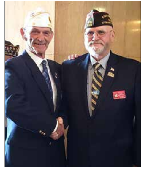
American Legion State Commander and Veterans of Foreign Wars State Commander

associated with all of those highways except the Persian Gulf, Afghanistan and Iraq Veterans Memorial Highway. Below is a map of the 8 veterans' highways with the 471 mile east-west POW/MIA Memorial Highway marked in black. At the