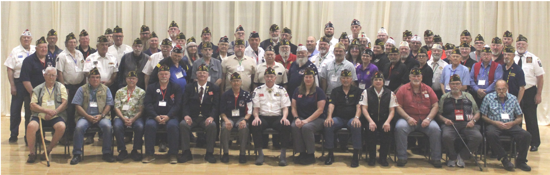
Above: VFW Attendees at the 104th Convention of the Department of Oregon Veterans of Foreign Wars. Below: Auxiliary Attendees on Red Friday!