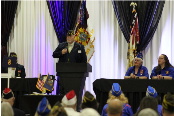
Adjutant General Dan West addressing the Joint Opening of the 2025 Department of Oregon Convention.