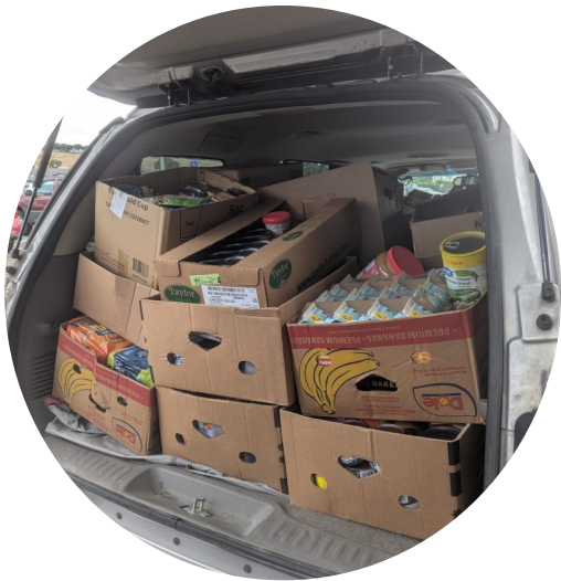
Just some of the Food donations collected at Convention. The food will be put to good use! 1,623 lbs. went to Veterans Advocates of Idaho and Oregon and 1,502 lbs. went to the Milton-Freewater Elks Lodge Veterans Food Pantry.”