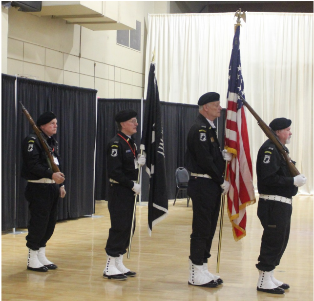
VFW Post 3232 Color Guard prepares to post the Colors at the 2025 Dept. of Oregon Convention.