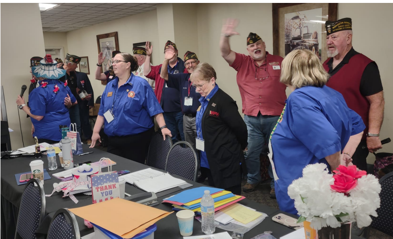
The VFW Line comes to visit the Auxiliary.