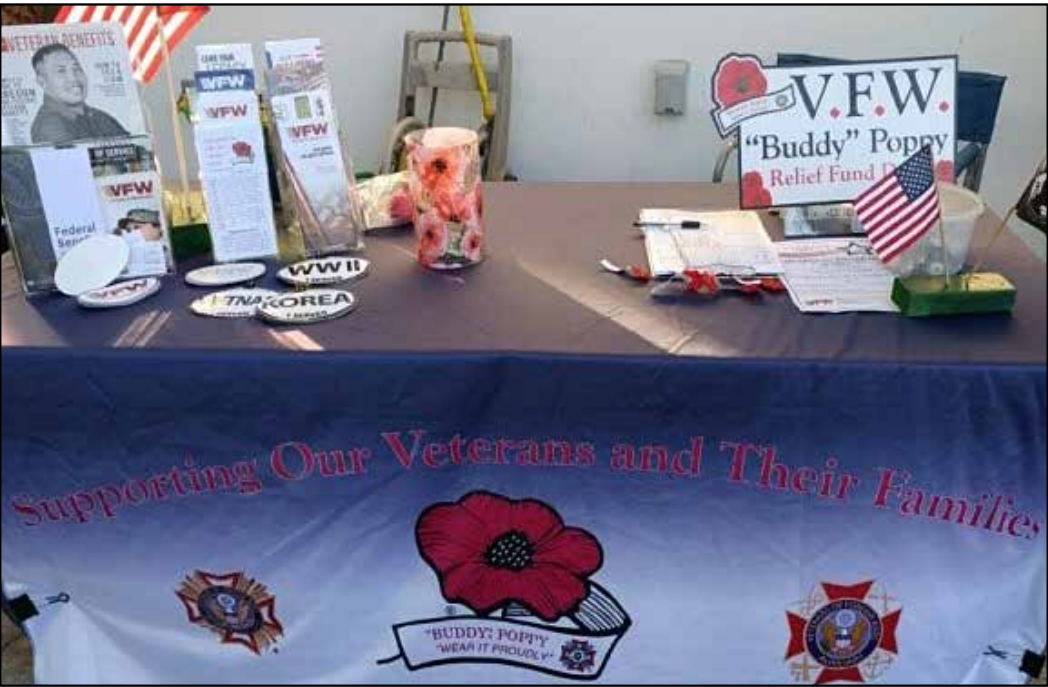
Lake Oswego Best Overall