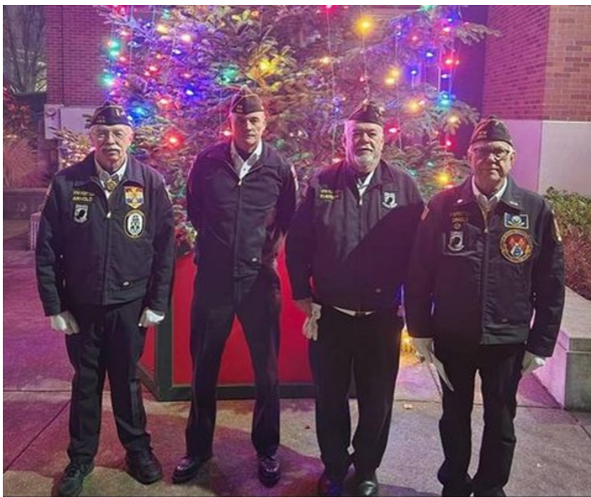
Left: On December 21, 2023, Post 1324's Honor Guard posted the colors and played Taps for the first Candlelight Vigil held at the Oregon City Courthouse for those who passed away due to overexposure to the cold.