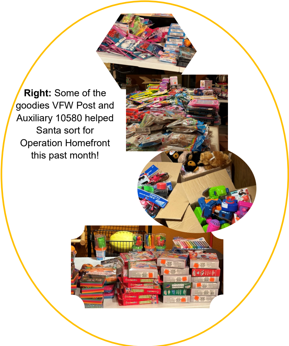
Right: Some of the goodies VFW Post and Auxiliary 10580 helped Santa sort for Operation Homefront this past month!

The Auxiliary to VFW Post 584 in Albany, Oregon, held a free breakfast with Santa event on December 16. They had 50 kids attend and served festive pancakes topped with whipped cream and sprinkles. Kids could also go to the cocoa bar and have custom cocoa made for them! Then they had a craft to do while waiting for Santa. Members also gave each child a treat bag filled with goodies and Santa gifted each child a gift and a coloring book.