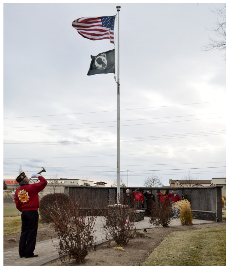
Right: On the third Wednesday of every month, VFW Post 4108 & American Legion Post 44 combined Honor Guard play TAPS at the Hospice of Redmond (4:30pm) and Redmond Memorial Cemetery (5:00pm) to honor those brothers and sisters who are no longer with us.