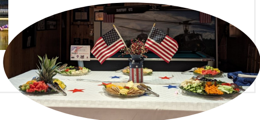
Above left: Dancing to Cheyenne West band. Above right: Appetizer spread for the VIP Donors.