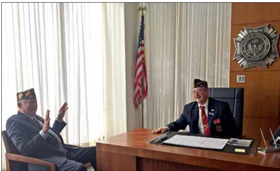
Playing National Commander.