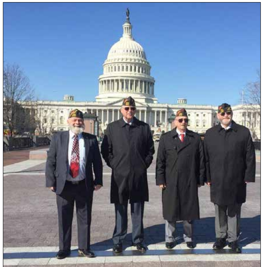
Men in black.