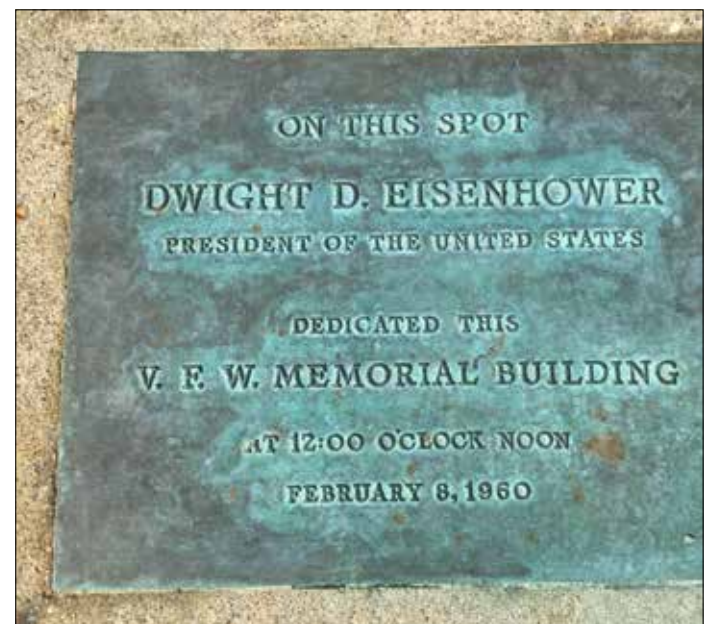
D.C. VFW office.